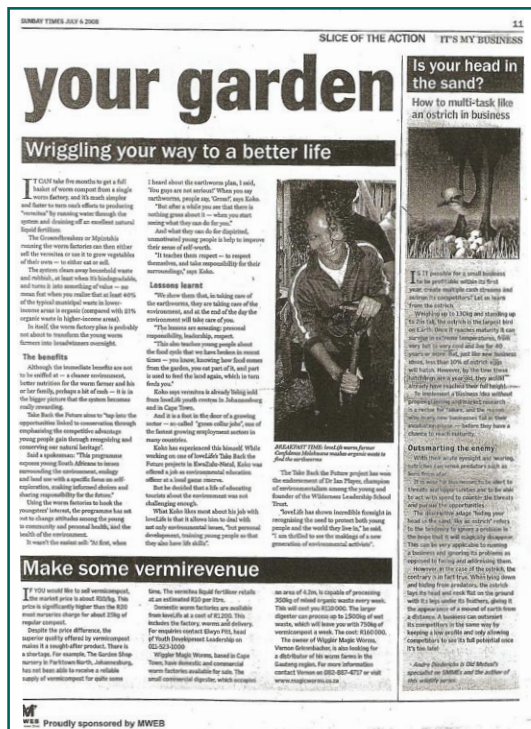
An article on FullCycle's 3 day training programme for LoveLIFE

FullCycle has a community garden at the Noordhoek Farm Village where we teach people how to grow their own veggies using the 'Door Frame' method. The veggies are grown using vermicompost processed from the waste at the village. Anyone can grow veggies using this simple method even if they only have concrete on which to build their garden. We offer workshops monthly.